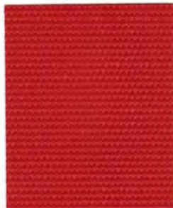
Dark Red #839908