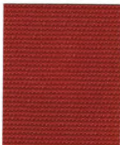
Terra Cotta Red #839915