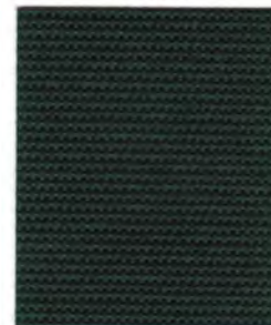
Forest Green #839909