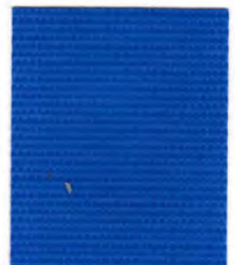
Blue #839902 KAPPA