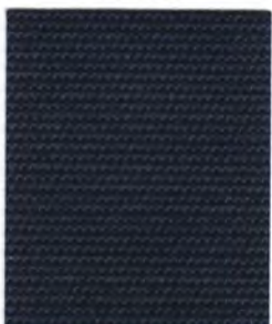
Dark Blue #839910